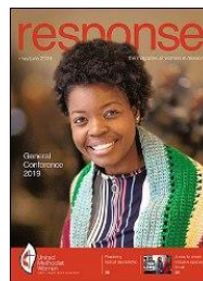
2019 Spiritual Growth Retreat