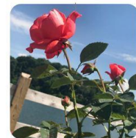
Thorns & Roses